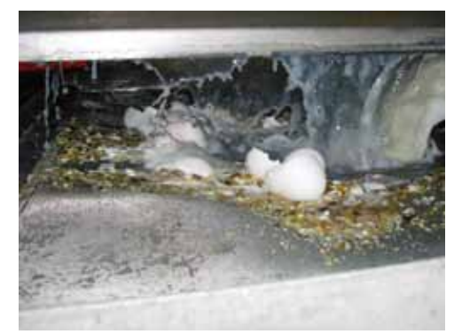
Figure 7. A manual static screen is used just below an egg washer to capture grit particles early in the shell egg cleaning, grading and packaging process. This early intervention step will significantly reduce the amount of grit entering the wastewater treatment system.

and Microscreens , with gaps < 0.008 inches (0.2 mm). The advantages and disadvantages of screens for grit recovery in shell egg processing wastewater are listed in Table 1 . Based on these advantages and disadvantages, simple manually-operated static screens ( Figures 7 and 8 ) are usually preferred in commercial shell egg processing.