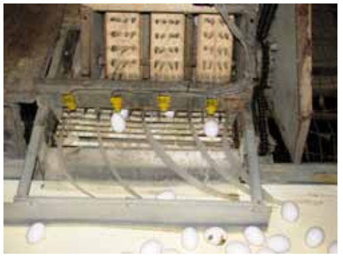
Figure 4. Minimizing egg breakage begins in the layer house. Here, flexible plastic strips are used to ensure a smooth transmission of eggs onto the processing plant transfer belt. Without the aid of the plastic strips, eggs would roll unchecked onto the belt, increasing breakage.

Typically, 1 to 2 percent of shell eggs are broken during the conveying, washing and grading process. This means that a commercial egg processing facility that handles 1 million eggs per day will produce 10,000 to 20,000 broken eggs. The percentage of broken eggs varies by flock, season and type of processing equipment utilized. The longer broken eggs remain on the processing line, the more opportunity broken pieces of egg shell and liquid egg contents have to enter the wastewater stream ( Figures 4 and 5 ).