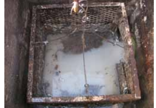
Figure 8. A manually operated basket screen is used to capture grit prior to the wastewater treatment system at a shell egg processing plant. If cleaned on a consistent, periodic basis, static basket screens can be efficient grit recovery devices.