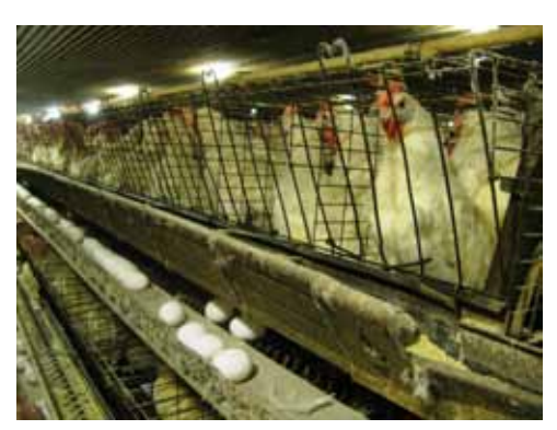
Figure 3. Minimizing the external debris on eggs within the layer house will minimize the amount of grit entering the shell egg processing facility, thus reducing the grit load on the wastewater treatment system.

<u>Minimize external debris on eggs entering processing</u>. Investigate causes of high levels of external debris and institute management practices to minimize external debris on eggs entering the processing facility. (For example, the longer hens have access to laid eggs, the dirtier they can become. Thus, layer cage bottoms should be checked to ensure a proper slope is maintained to efficiently move fresh-laid eggs to the conveyor system.) Cleaner eggs entering the processing plants will significantly reduce not only the grit entering the wastewater treatment system but also the overall wastewater load.