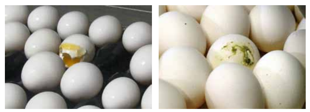
Figure 2. Grit from shell egg plants is predominately made up of external debris (e.g., feces and dirt) and broken egg shell.

In commercial shell egg processing wastewater streams, grit is predominately made up of pieces of broken egg shell and the particles associated with the debris (e.g., feces and dirt) cleaned from the outside of eggs during washing ( Figure 2 ).