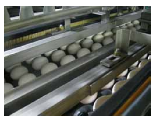
Figure 6. Taking the time to observe egg washers during operation can help processors identify needed adjustments if excessive breakage is occurring during the washing process.