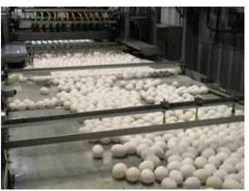
Figure 1. A portion of the 900,000 eggs entering a Georgia shell egg processing plant from layer hen barns daily. Georgia shell egg processors annually produce more than 7 million cases of table eggs (2.5 billion eggs) and, in the process, generate 10.5 to 21 million gallons of wastewater requiring treatment.

One essential element of an effectively operating commercial shell egg processing wastewater treatment system is the efficient removal of grit. The effects of poor grit removal are often not immediately apparent, but the negative effects can be substantial. These negative effects include a